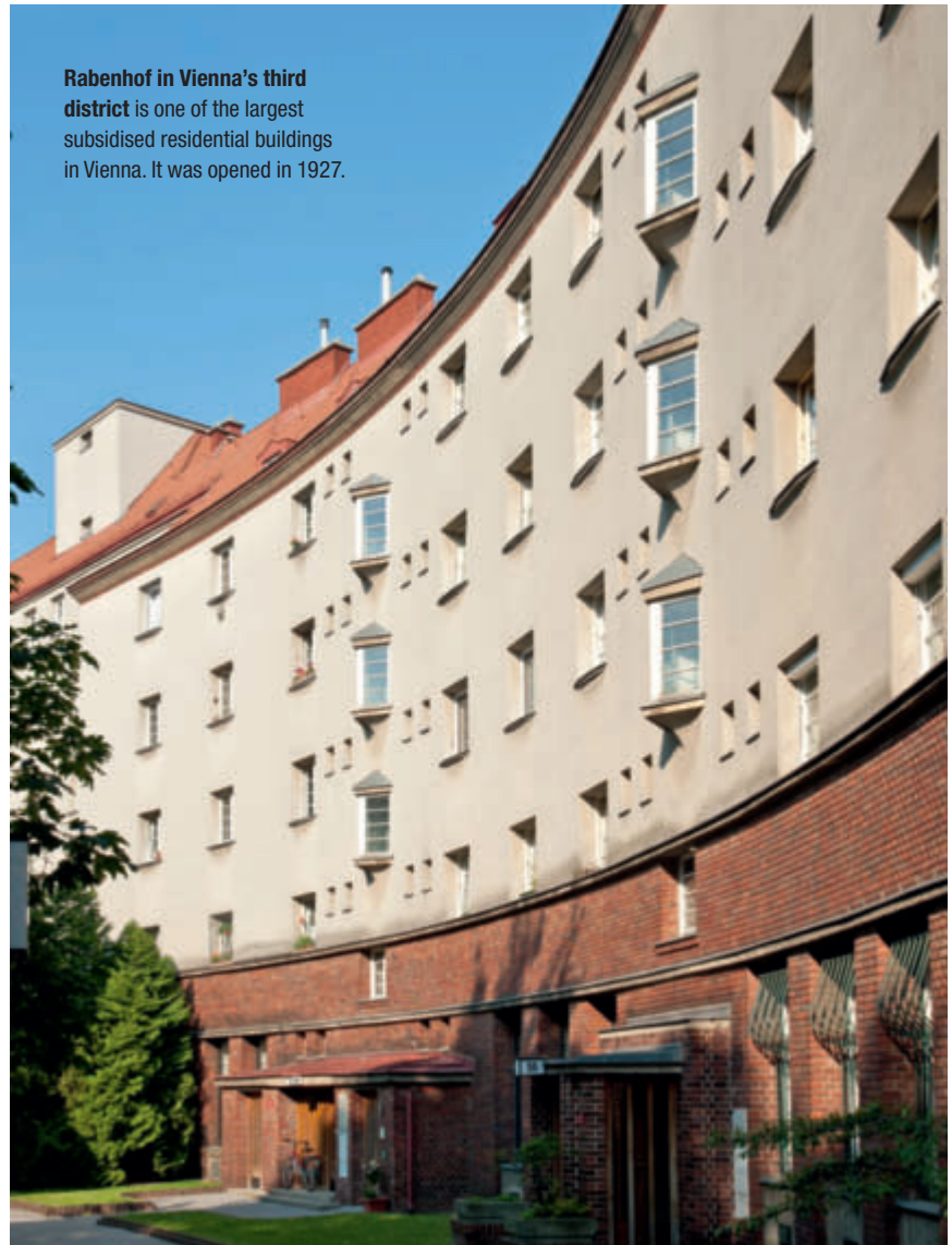
Rabenhof in Vienna’s third district is one of the largest subsidised residential buildings in Vienna. It was opened in 1927.

Vienna is playing a leading role in the implementation of the EU Strategy for the Danube Region. According to the Mayor of Vienna, Michael Häupl, “Raising the quality of life in the cities and regions is a key task.” Together with Slovenia, Vienna is coordinating the Priority Area “To step up institutional capacity and cooperation”. This key area comprises tasks such as the exchange of expertise in administration and the further development of civil society. This also means giving all people access to social services, education and healthcare, making it possible for them to use public transport and offering