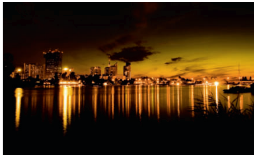
Vienna, the city on the Danube, at night.

"The Danube region is our shared living space, environmental region, economic community and transport region – so let's solve our problems by working together!"