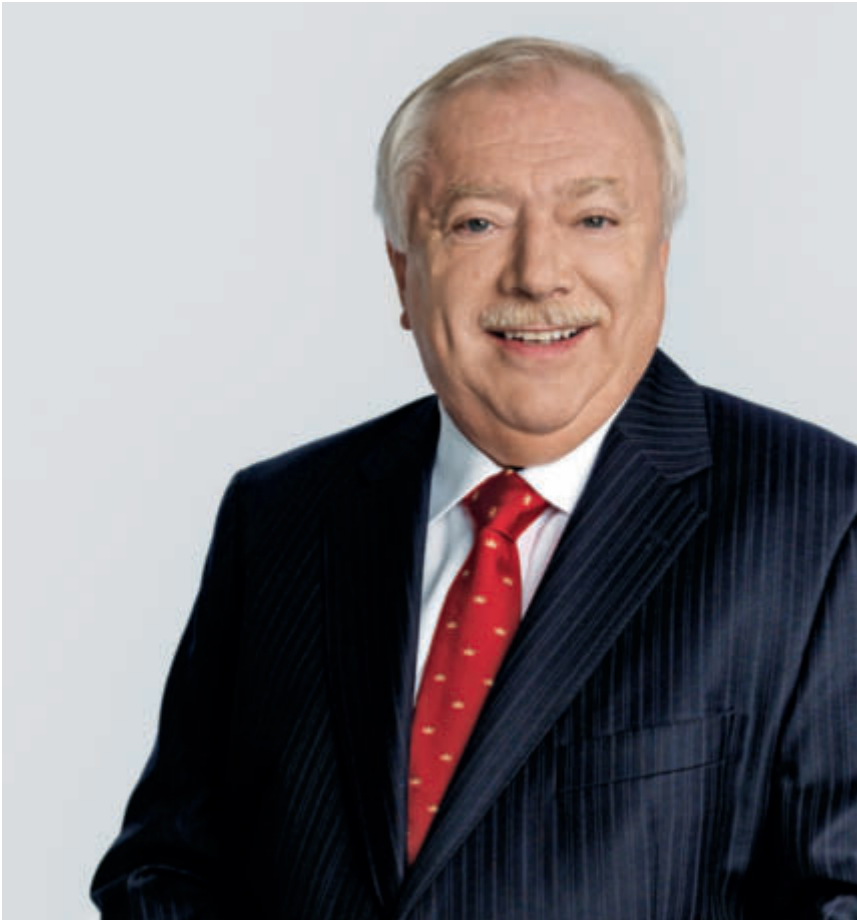
Michael Häupl, Mayor of the City of Vienna

“For us, it comes down to the desire for well-functioning cities.”