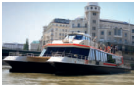
The Twin City Liner lands at Vienna's Urania and travels between Vienna and Bratislava.

The Twin City Liner. It travels four to five times a day between Vienna and Bratislava at speeds of up to 60 kilometres per hour. The trip takes around 75 minutes. The catamaran was developed specially in Norway for the low water level of the Danube Canal.