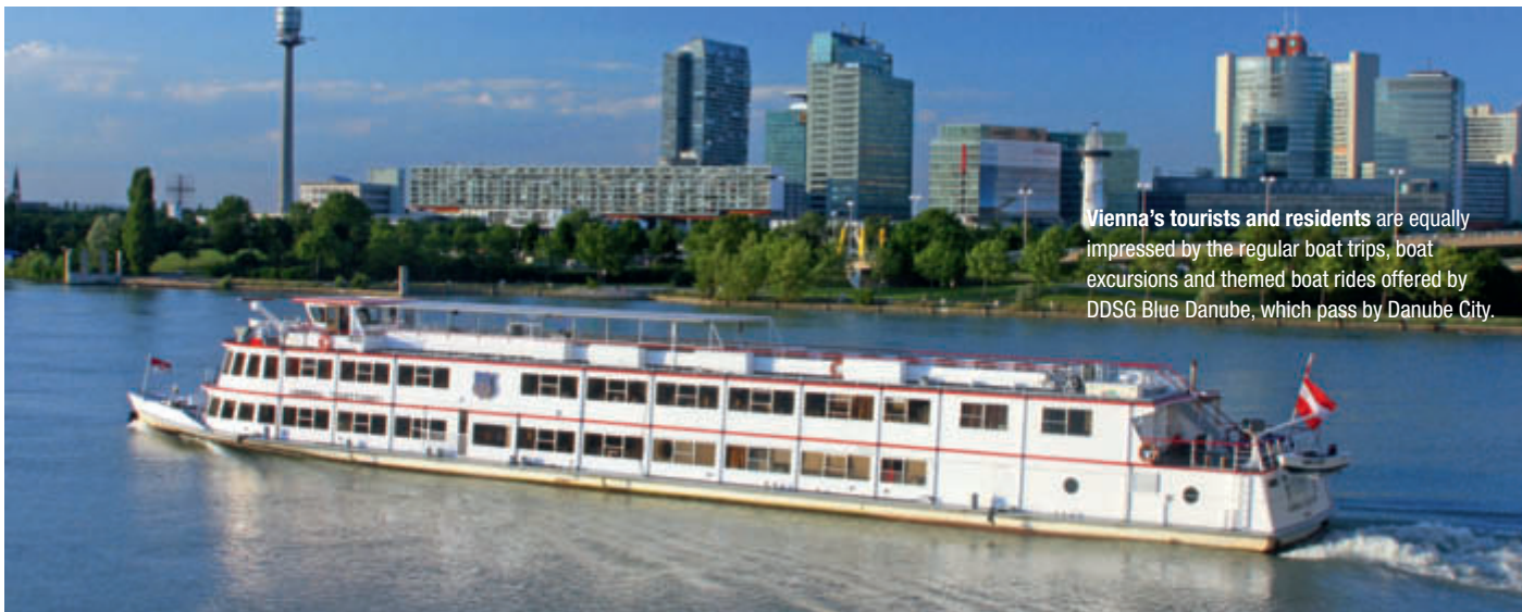
Vienna's tourists and residents are equally impressed by the regular boat trips, boat excursions and themed boat rides offered by DDSG Blue Danube, which pass by Danube City.