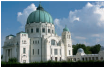
The Church of St. Charles Borromeo at Vienna's Central Cemetery is one of the most important art nouveau churches.

Vienna's Central Cemetery has roughly 60,000 graves. Hamburg-Ohlsdorf is the only cemetery that is even larger, at 3.9 million square metres. There are around 1,000 graves of honour at Vienna's Central Cemetery: For example, Johann Strauss, Carl Ritter von Ghenga, the designer of the Semmering Railway, Chancellor Bruno Kreisky, Curd Jürgens, the architect Adolf Loos and Falco are all buried here.