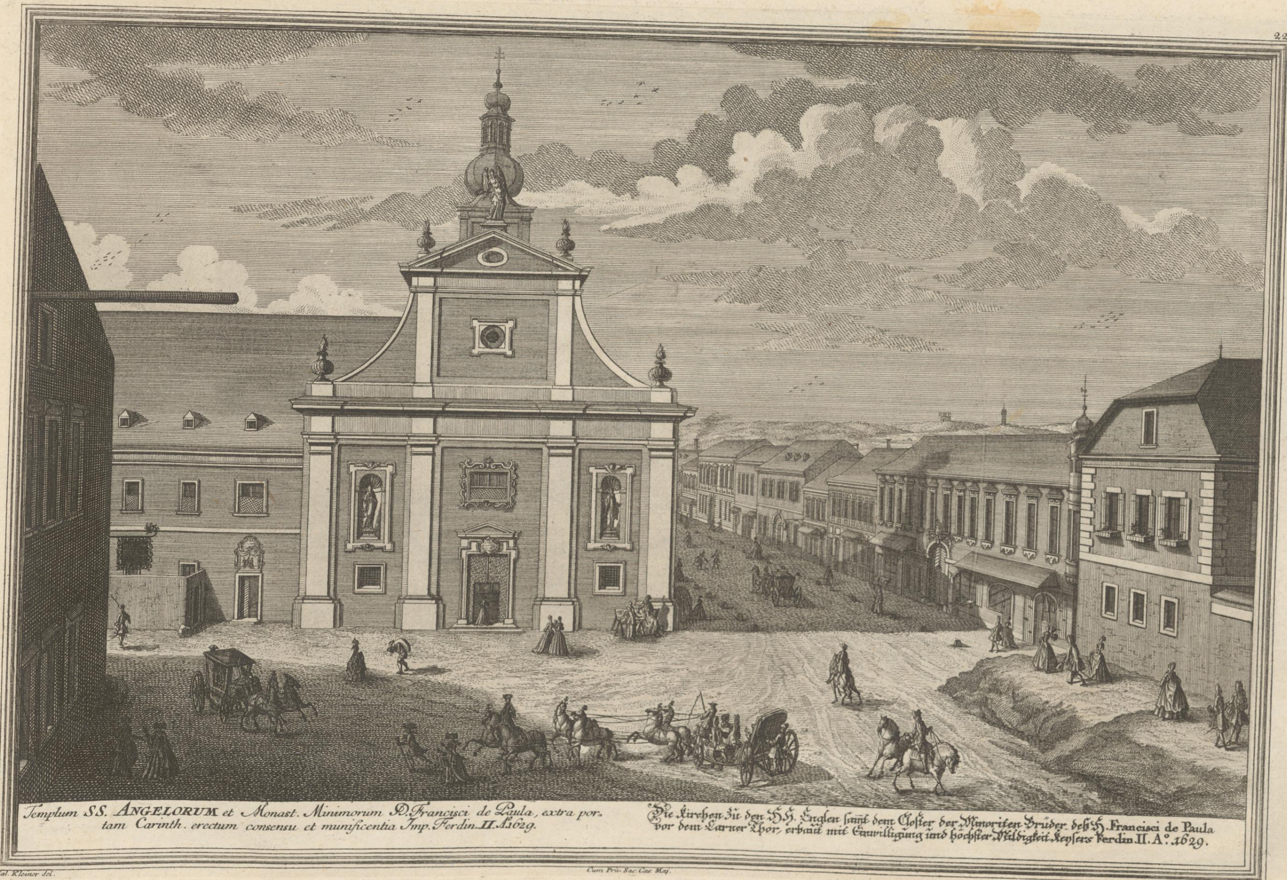
Templum SS. ANGELORUM et Monast. Minorum S. Francisci de Paula, extra portam Carinth. erectum consensu et munificentia Imp. Ferdin. II. A. 1629.