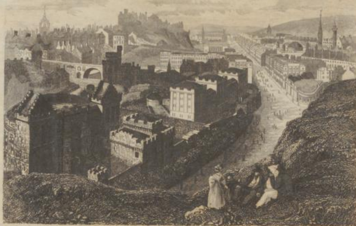
EDINBURGH FROM THE CALTON HILL.