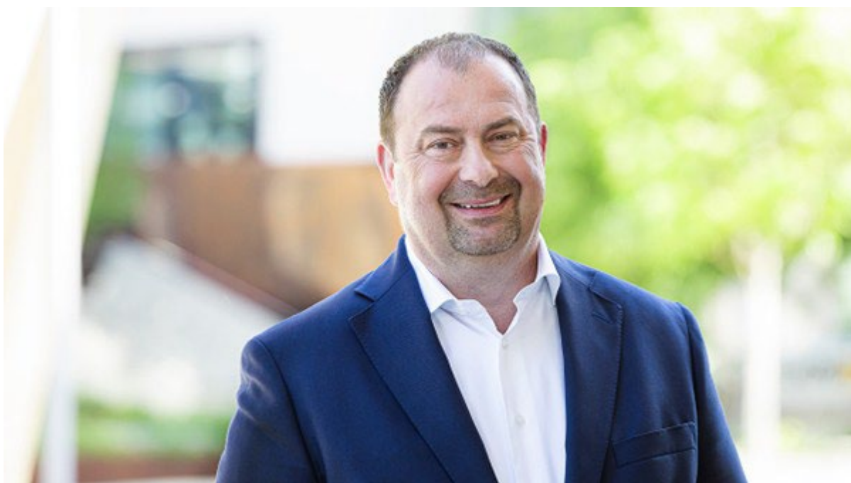
Figure 3: Alexander Nikolai, Chair of Leopoldstadt Municipal District Council (2nd district)