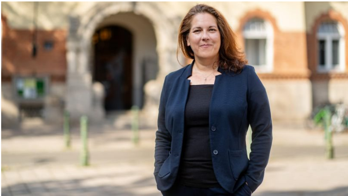
Figure 4: Christine Dubravac-Widholm, Chair of Brigittenau Municipal District Council (20th district)