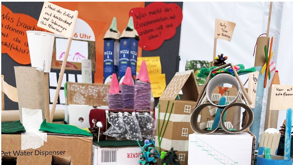
Figure 14: Children model their ideas for the city — here at the annual Vienna Housing Day event in Rudolf-Bednar-Park.