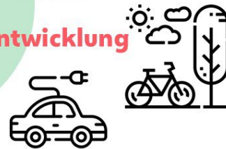
Figure 9: WieNeu+ – an integrated approach to urban renewal