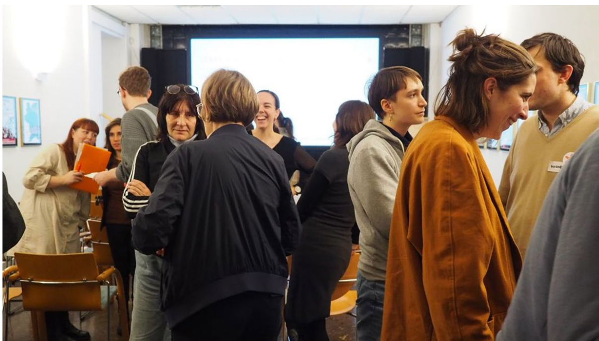
Figure 12: An ideas workshop fosters innovative ideas through networking, as seen here in the Wallensteinviertel neighbourhood.

Sustainable urban renewal only succeeds if it is done in dialogue with the people who live in the respective neighbourhoods. That's why WieNeu+ uses a wide range of participatory formats to actively engage local residents, showcase their ideas and promote community action. In many cases, these also act as a low-threshold platform for bringing local people on board and keeping them informed about WieNeu+ topics and issues. This approach delivers interesting projects that are not only innovative in terms of the built fabric but also have a social and cultural impact that strengthens people's identification with their living environment.