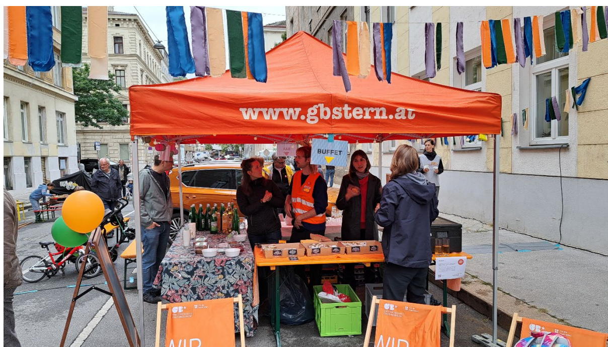
Figure 11: Local Urban Renewal Office (GB) stand at the Alliertenviertel street party

Public consultations are organised in the neighbourhood, along with outreach events on specific topics — e.g. the "Phasing Out Gas" programme, refurbishment activities or greening projects — to engage property owners and provide them with practice-based information. The Hauskunft advice centre and wohnfonds_wien (Vienna Fund for Housing Construction and Urban Renewal) with their teams of experts also provide support for refurbishment and renovation projects in the neighbourhood. A further focus is on providing assistance with applications for funding and subsidies.