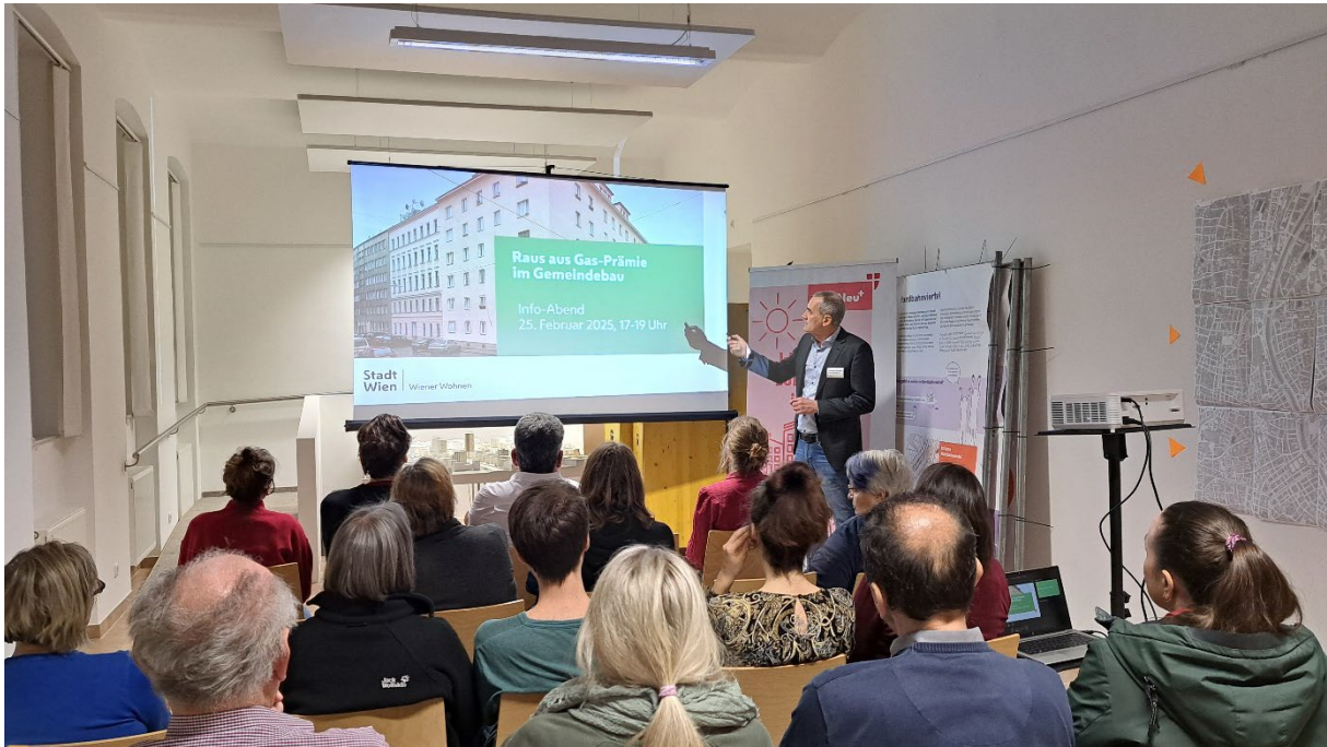
Figure 17: Outreach event informing people in the Alliiertenviertel neighbourhood about the decarbonisation bonus

WieNeu+ provides targeted funding to facilitate the development and roll-out of new and innovative solutions.