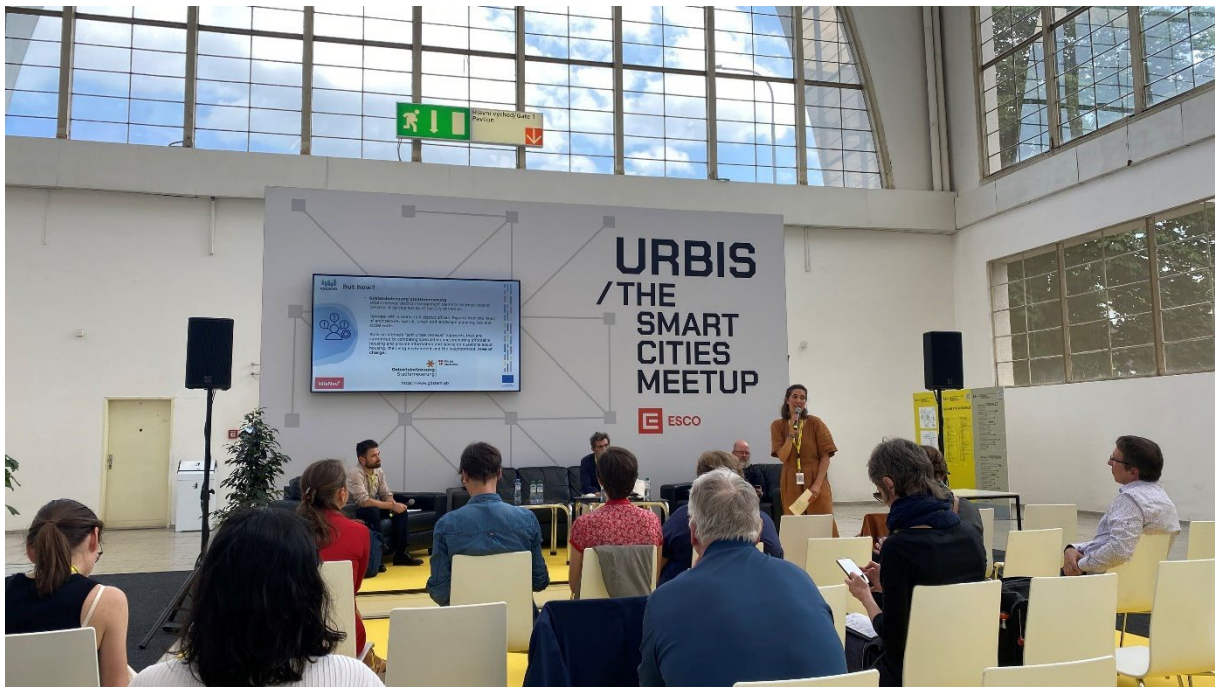
Figure 15: URBIS conference, Brno (CZ), May 2024

WieNeu+ is also an international flagship programme of the City of Vienna. Numerous innovations developed and implemented in practice under the auspices of WieNeu+ are prime examples of sustainable and socially just urban renewal that enrich the European discourse. Visits by professionals and experts from all over the world offer the opportunity for in-depth face-to-face exchange to showcase the Viennese approach to an international audience.