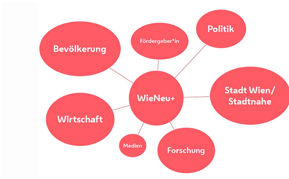
Figure 19: The WieNeu+ project environment within the municipal administration