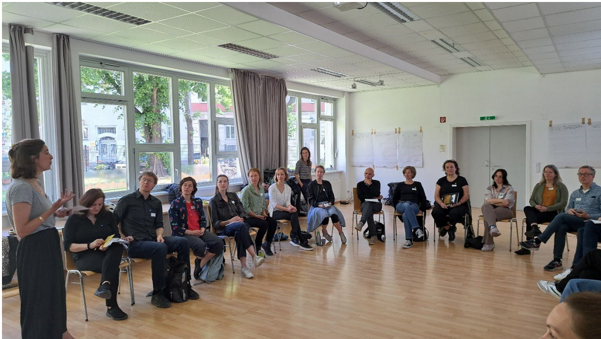
Figure 18: Grätzl 20+2 regular partners' meeting, May 2024

The fourth pillar and a key core competence of the WieNeu+ programme is Knowledge and innovation management . This creates an environment in which new solutions can be promoted, piloted and developed further. The aim here is to foster innovations that not only exert a positive impact in the respective WieNeu+ programme area but can also be transferred to other contexts and programmes, producing a long-term effect well beyond the lifetime of the project.